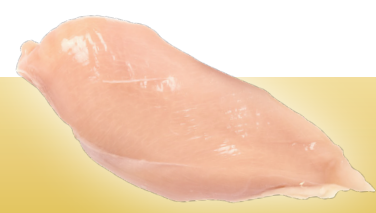
WITH HUMANE-AIRE Relaxed, Tender, Consistent Muscle