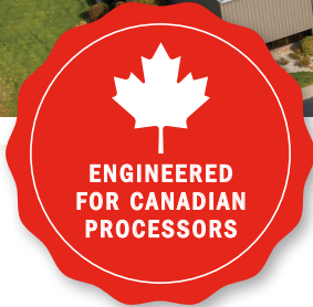
Manufacturing Plant State Street Location

Designed and manufactured in the US, Humane-Aire is supported by a comprehensive machine and fabrication facility, along with a dedicated facility for equipment assembly and runoff.