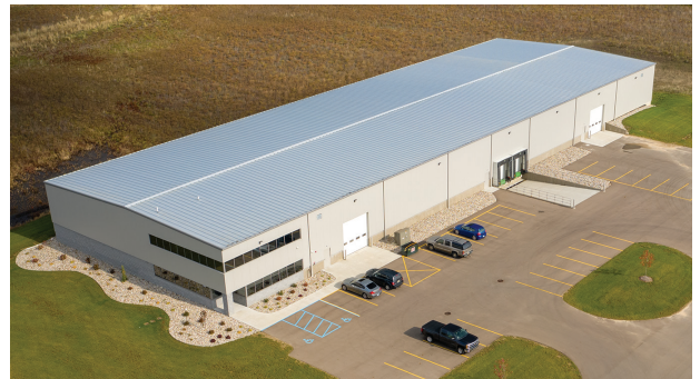
Assembly Plant Centennial Street Location

Designed and manufactured in the US, Humane-Aire is supported by a comprehensive machine and fabrication facility, along with a dedicated facility for equipment assembly and runoff.