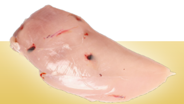
WITHOUT HUMANE-AIRE Hemorrhaging, Inconsistent Color and Muscle

Humane Aire can assist your specific requirements for plastic top loading poultry crates.