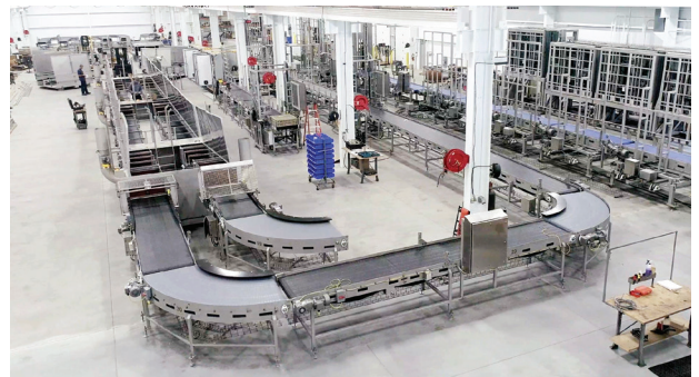
Equipment Test at the Assembly Plant

Source: Interview with Temple Grandin Meat and Poultry 07.16.19